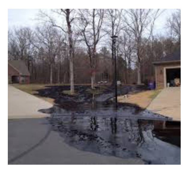
A pipeline spill on March 29, 2013 in Mayflower, Arkansas was an estimated 1 million litres of DilBit.

A decision by the Supreme Court to uphold the right of Canadian cities to pass bylaws to protect residents will change the balance of power in Canada toward more local control. This can pave the way for wider participation in key