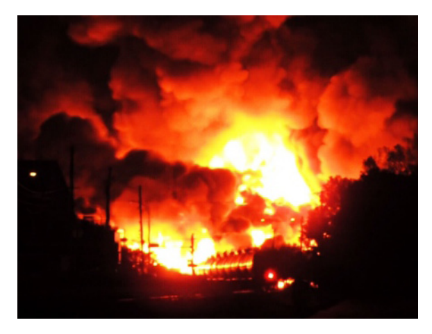
47 residents of Lac-Mégantic died when a train carrying Bakken crude exploded on July 6, 2013. That train travelled through the heart of Toronto on its way to the east coast.

decisions like Line 9. Cities can become the heart of a new, more direct democracy which values the commons and climate justice, while fostering community decision-making.